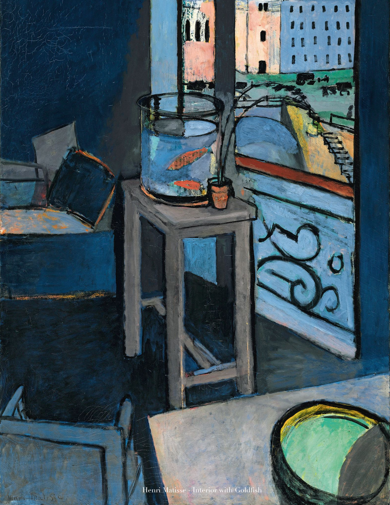
Henri Matisse - Interior with Goldfish